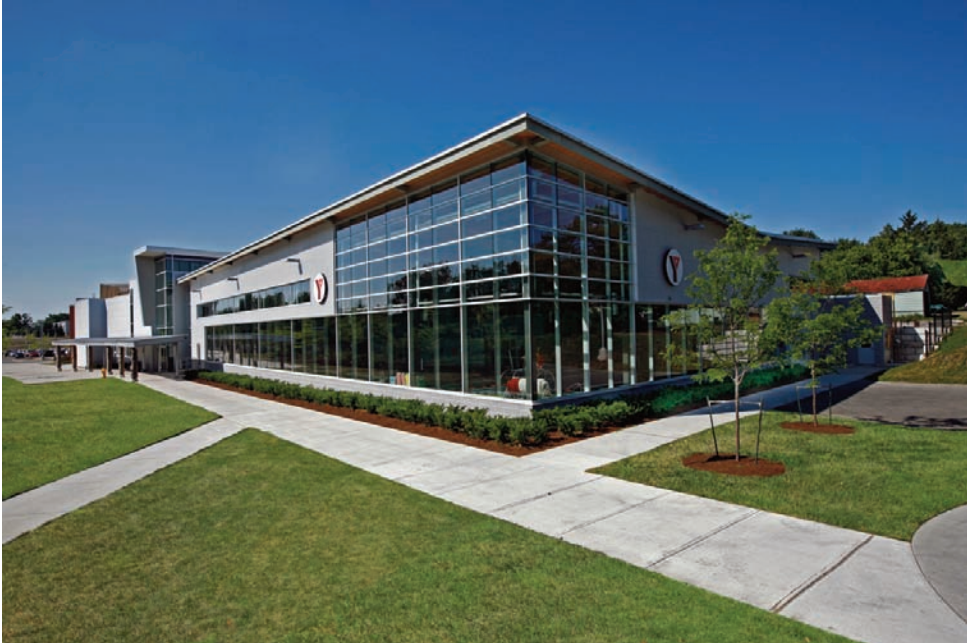
Gravenhurst Centennial Centre - CS&P Architects Inc.

Using our Alternative Approach to Building , Dalton established a collaborative environment designed to allow decisions to be made with the input of all key stakeholders, acting as equal partners. The process assisted everyone in dealing efficiently and effectively with overcoming a number of difficult obstacles throughout the construction process, which could have had a negative impact on a project. We worked in close partnership with CS&P Architects, their consultants, and our trade contractors. Our site and project management team facilitated every step through completion.