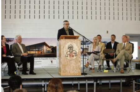
Honourable Tony Clement

The scope of work was significant: it involved renovating and creating a 70,000 SF addition that includes a state of the art recreational centre for aquatics, banquet hall space, and a gym and fitness centre - all to provide much needed new program space.